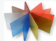
Double-sided Frosted Sheets