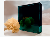
Cast Acrylic Mirrors