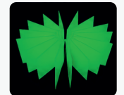
In the Dark