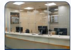
Security Glazing & Partitions