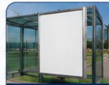
Signage & Display Solutions