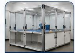
Laboratory & Clean Room Enclosures