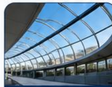
Skylights & Canopies